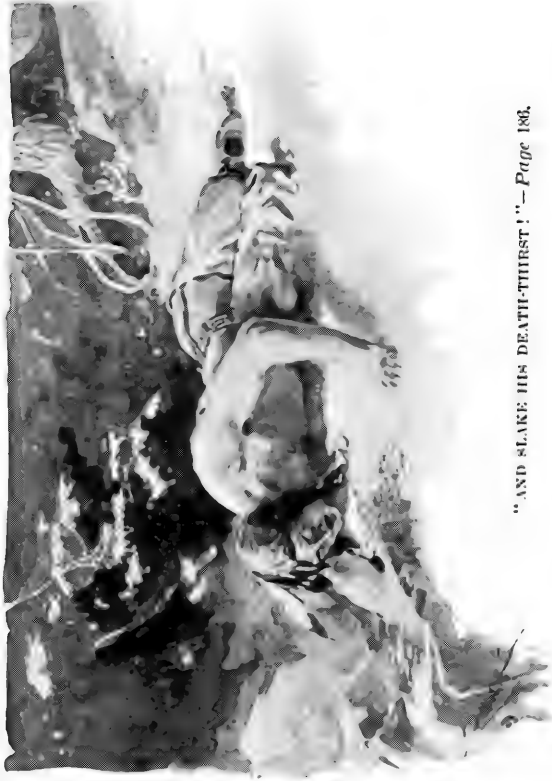
"AND SLAKE HIS DEATH-THIRST!"—Page 183.